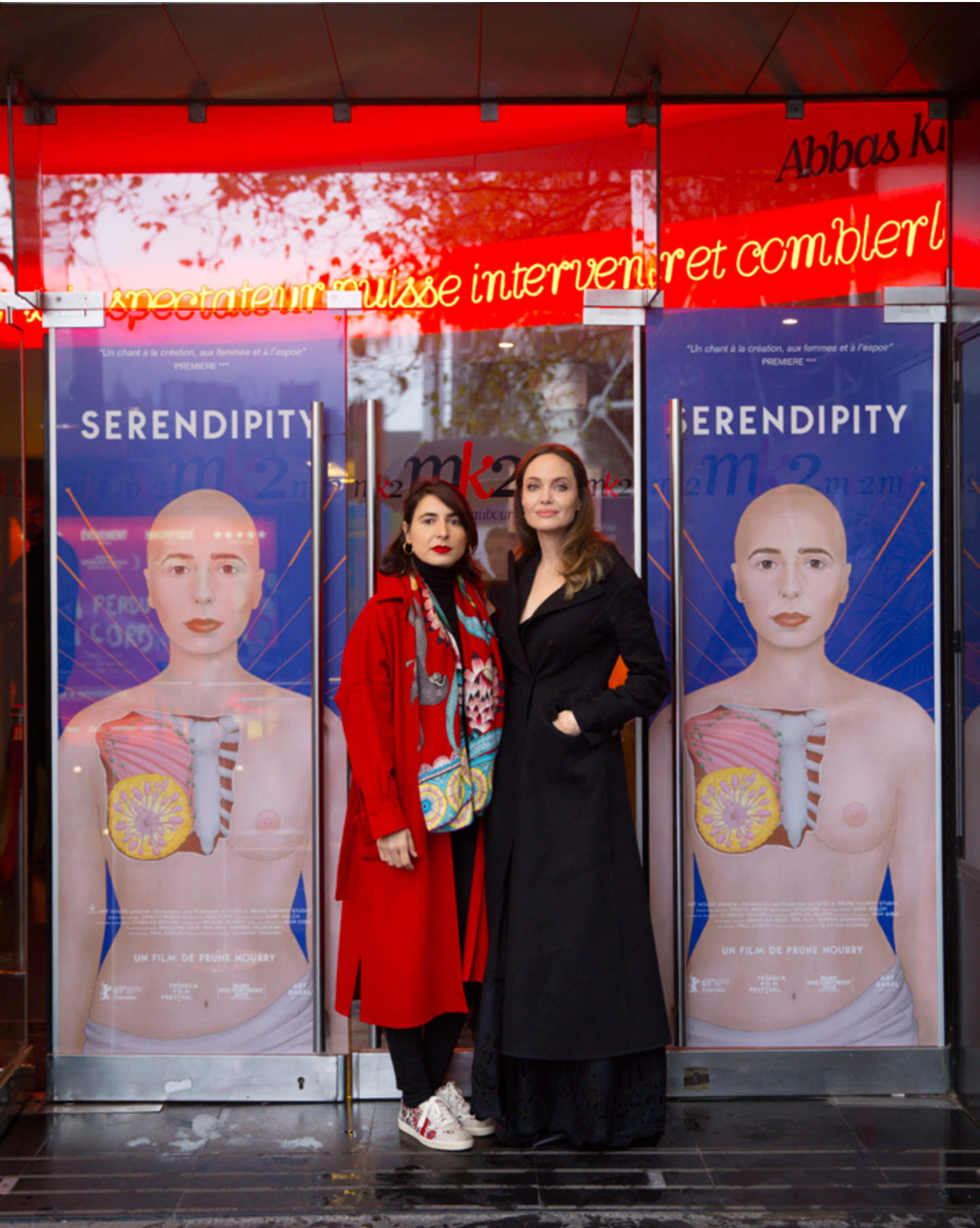
Prune Nourry and Angelina Jolie at the mk2 Beaubourg private screening in Paris on October 20, 2019

- A special screening focusing on Art Therapy ( upcoming )